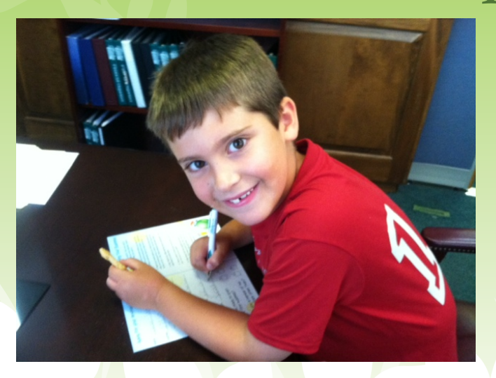
Thank you Jr. Scientists!

As our Jr. Scientists get to about 10 years old, they get to help out the TEDDY Study more on their own. They fill out their own